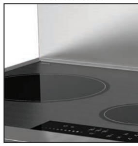
Slide Touch Control