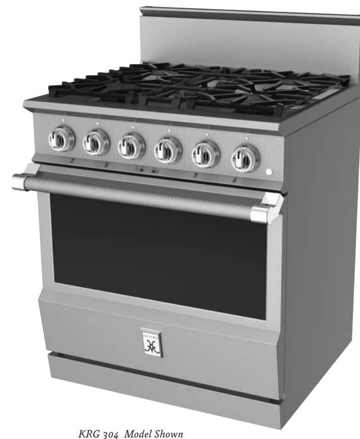
KRG 304 Model Shown with Accessory 10" Backguard KBGLB30