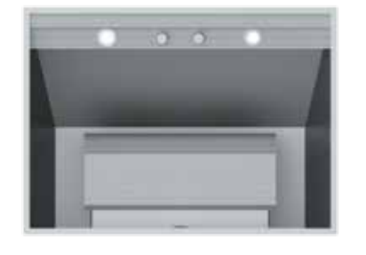
36" Liner Hood Also in 30", 42", 48" and 54" widths

Cooking tends to leave behind a joyous mess. Hestan happily (and silently) handles it. Hestan hoods clear the air of even the most intense cooking odors with best-in-class ventilation while safely collecting 70% more grease than most competitors. The dishwasher cleans everything from stock pots to stemware quietly, carefully and thoroughly with its patented Double Axial Washing System<sup>™</sup>. Then the automatic door pops open to maximize airflow and conserve energy for spot-free drying. It's the next best thing to a magic wand.