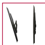
Low-profile design at 1" (25 mm) with tilt lock at 0^\circ