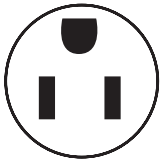
Plug Type (NEMA) 5-15P

1 Warranty 5 year sealed system / 1 year full parts and labor.